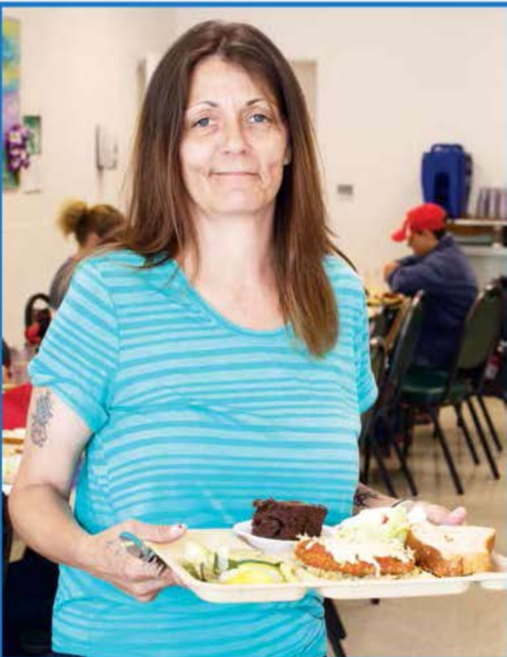
Often the desire to change starts with a simple meal.