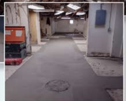
New Kitchen Cement