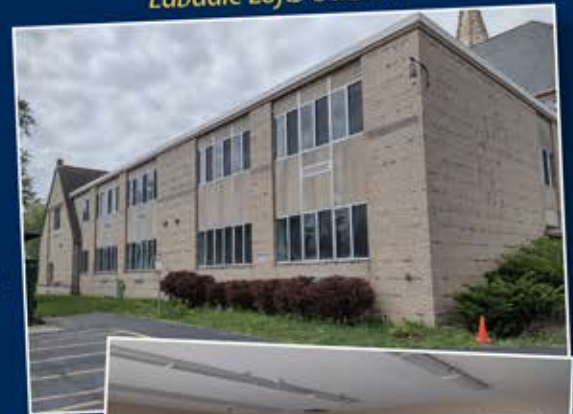
Labadie Lofts Outside

The new permanent housing program is for young people 18-22 years who have aged out of Foster Care. This supportive program will allow youth to live independently in their own affordable apartment while participating in life skills classes and working and/or attending college or trade school. The goal of Labadie Lofts is to provide housing that encourages a successful launch to life. Each tenant will be expected to set personal goals and will be regularly challenged to live in compliance with their stated life.