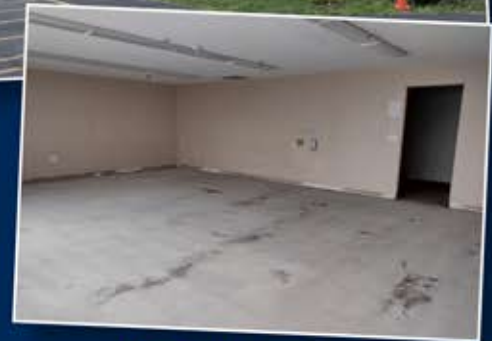
Labadie Lofts Before